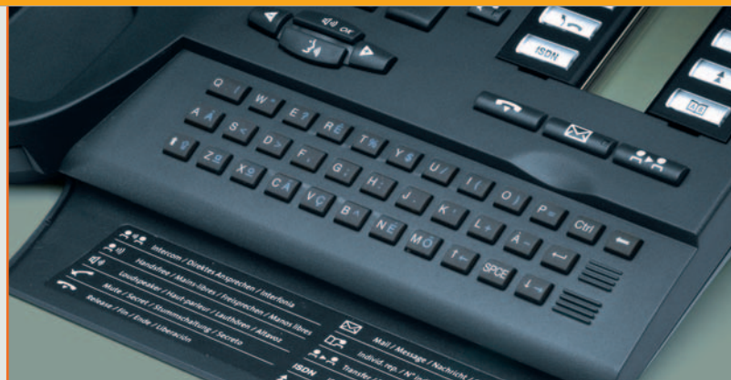
▲ Alphabetical keyboard

The Alcatel Premium and Advanced Reflexes™ are equipped with an alphabetic keyboard. This device allows access to the "call by name" company directory and to "text mini-messaging" services.